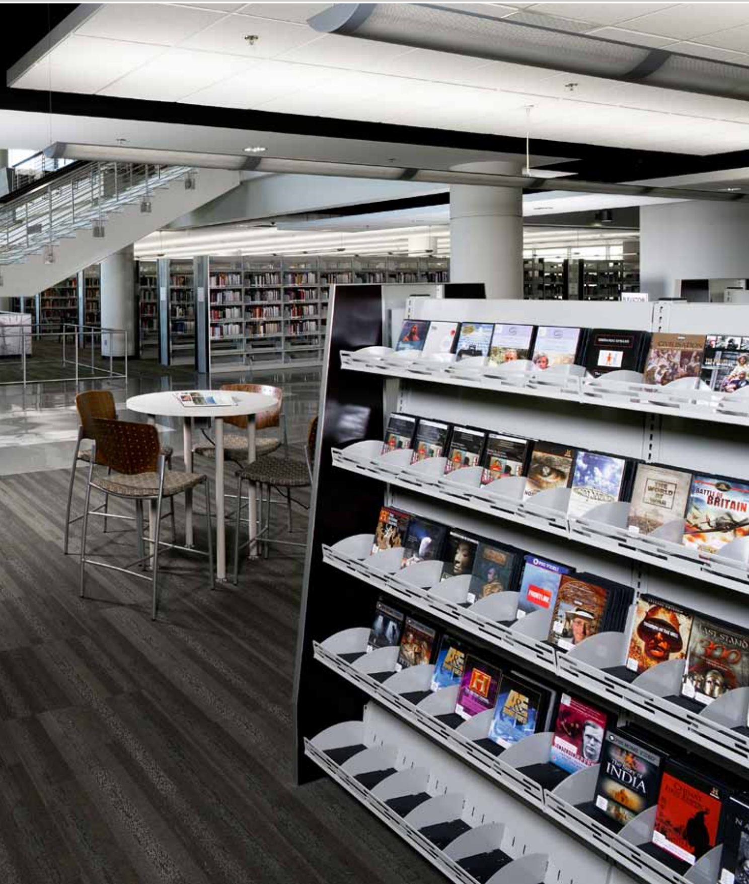
Georgia Gwinnett College, Lawrenceville, GA